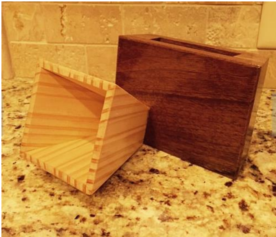
(box pictured above on Etsy sells for $35)